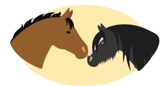
Don't allow your horse to make contact with any other horses, who might pass on diseases.