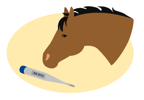
If you have any concerns about your horse's health, such as a fever, cough or lethargy, don't travel him.