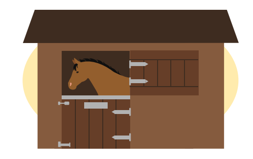
Isolate your horse upon returning home. Closely monitor him, including twice-daily temperature checks.